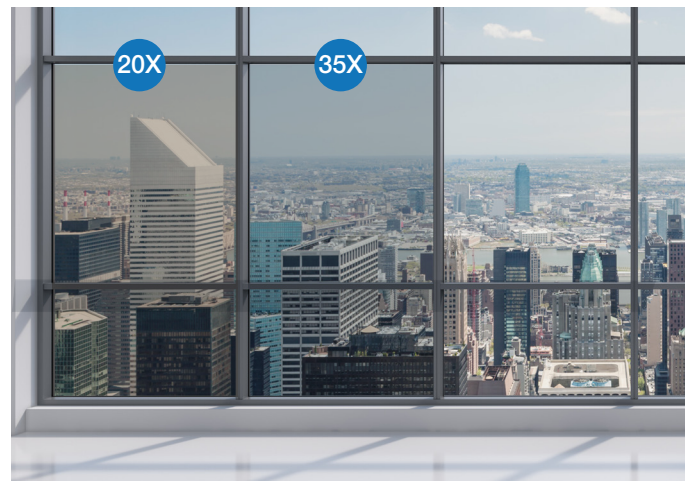
DS Bronze 20X

This image has been simulated and is not actual product comparison