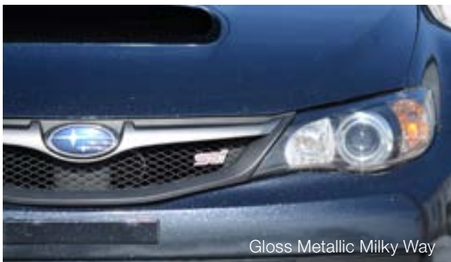
Gloss Metallic Milky Way